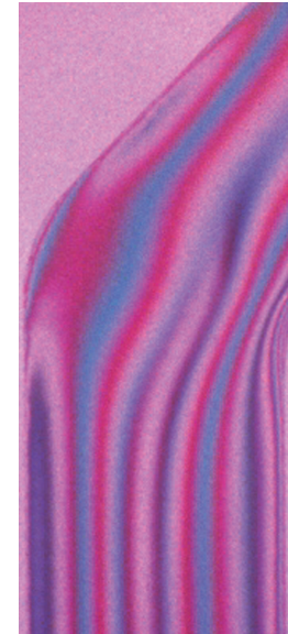
Detail from light-field photoelastic interferometry fringe pattern obtained using simultaneous illumination from two laser sources: Argon at 488 nm (turquoise) and Helium-Neon at 633 nm (red). The granular appearance is caused by laser speckle.